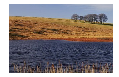
Paid for by Water for Huerfano's Future

The Huerfano County Water Conservancy District (HCWCD) was organized by landowner petition on September 27,1971 in Huerfano County District Court under the Colorado Water Conservancy Act of 1963, CRS Section 37-45-101. This is not part of County government or any municipality. The Board of Directors monitors Water Court applications and opposes those which threaten the stability of water rights and water availability in Huerfano County.